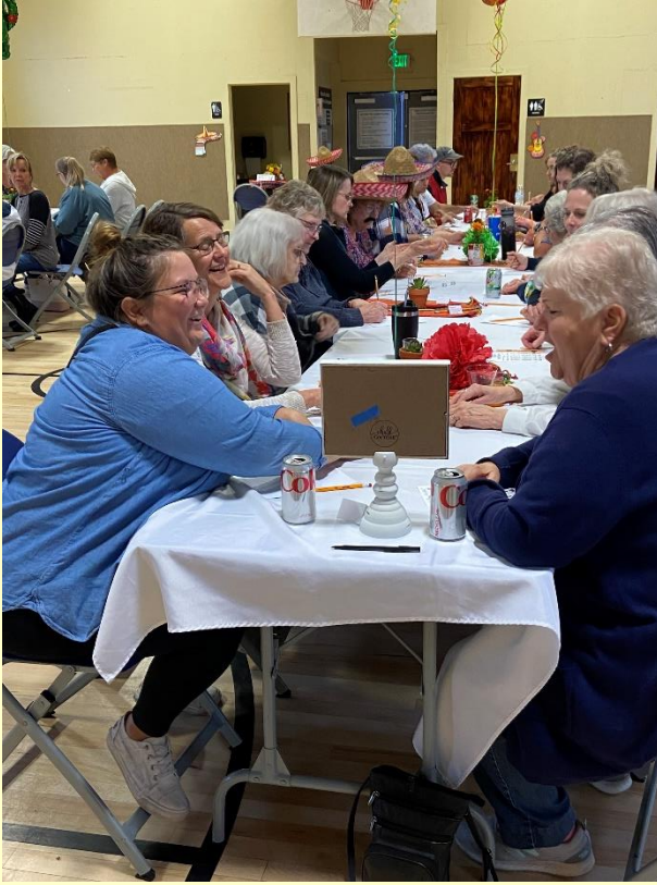
Bunco players having a good time!